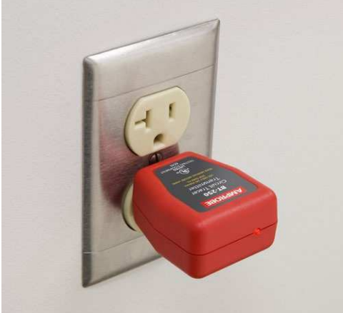
Plug the transmitter into an outlet and receiver will find the corresponding breaker.