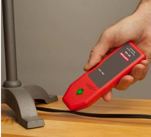
Designed for use in residential and light commercial environments.