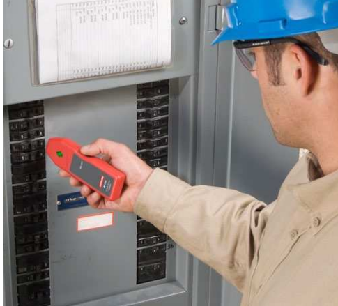
The receiver always finds the right breaker - automatic sensitivity adjustment removes ambiguity from the search by indicating single, correct breaker with light and sound.